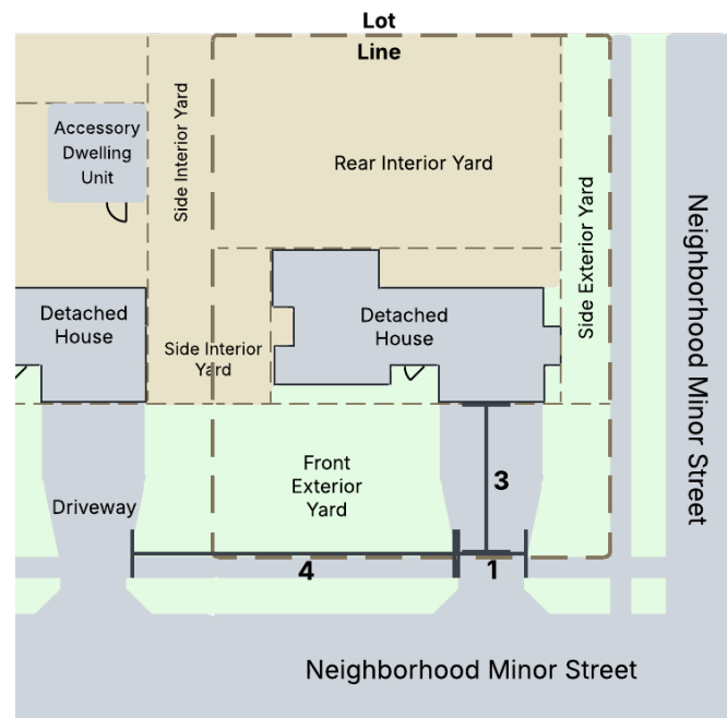
Figure 4.2.3.B Access and Parking Diagram